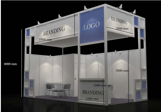
Design-3 - EUR 80/m 2