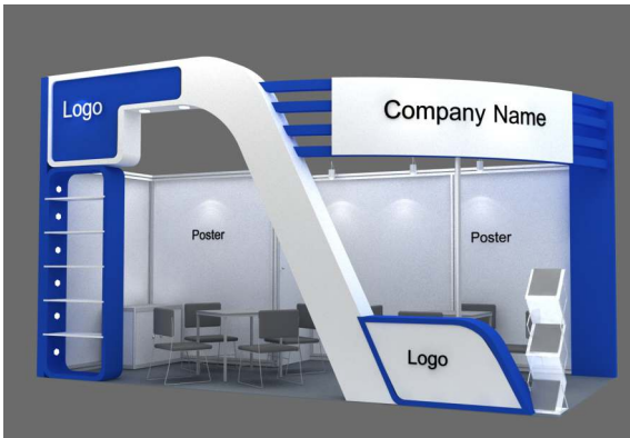
Design-4 - EUR 139/m 2

The design may vary if the stand size or number of sides open differ.